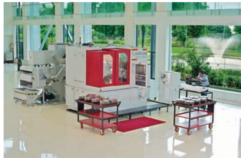
Gear Tooth Profile Grinding Machine