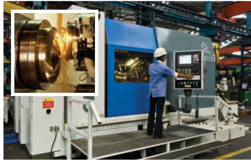
Spiral Bevel 'Hard Cut' Machine (1100 mm Dia)