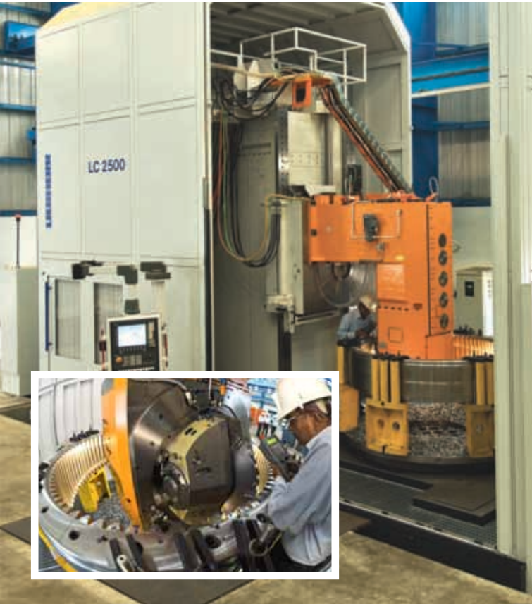
Gear Hobbing Machine (Internal / External - 3000 mm Dia)