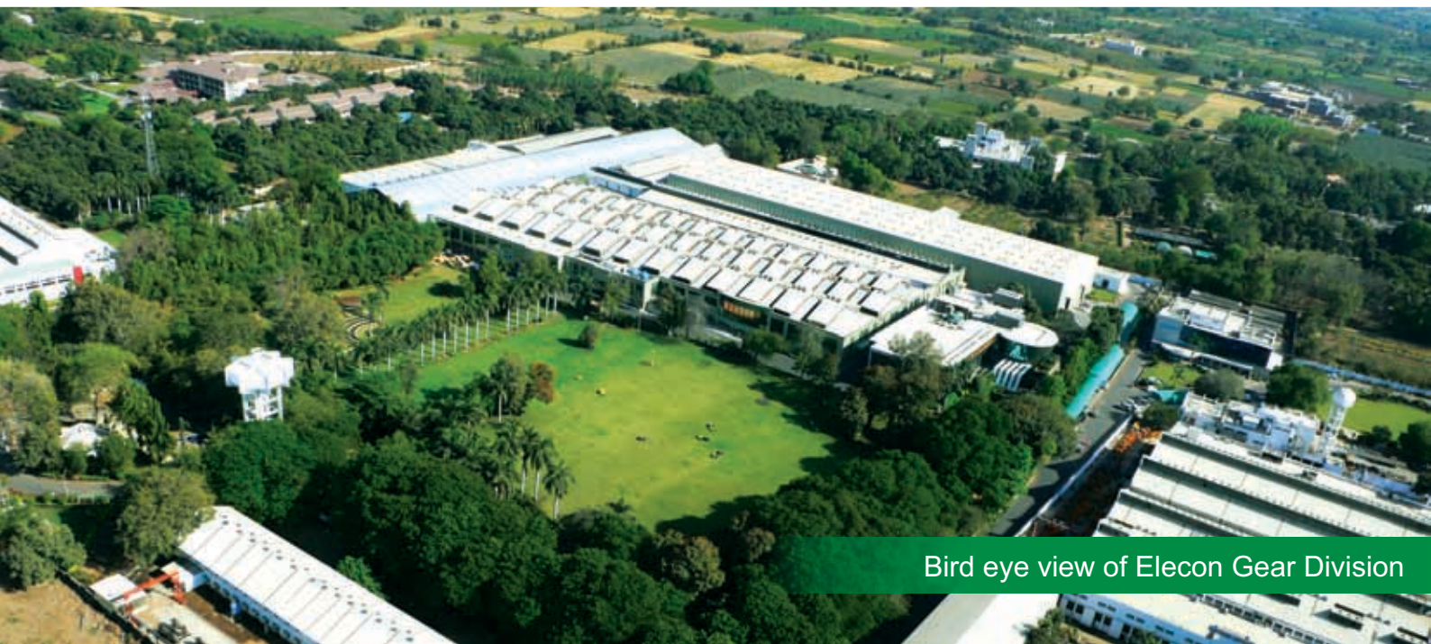
Bird eye view of Elecon Gear Division