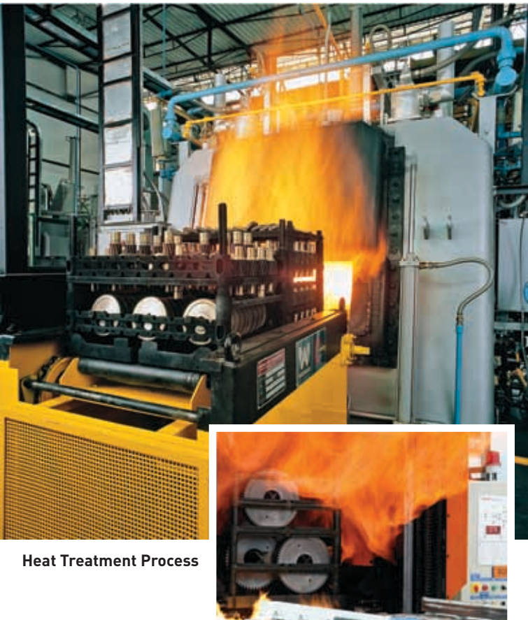
Heat Treatment Process