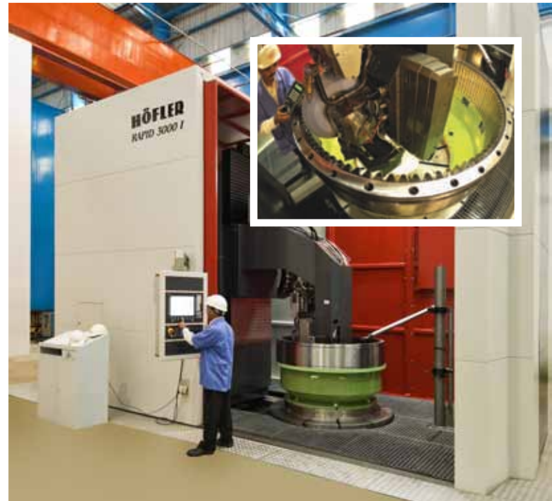
Profile Grinding Machine (Internal / External - 3000 mm Dia)